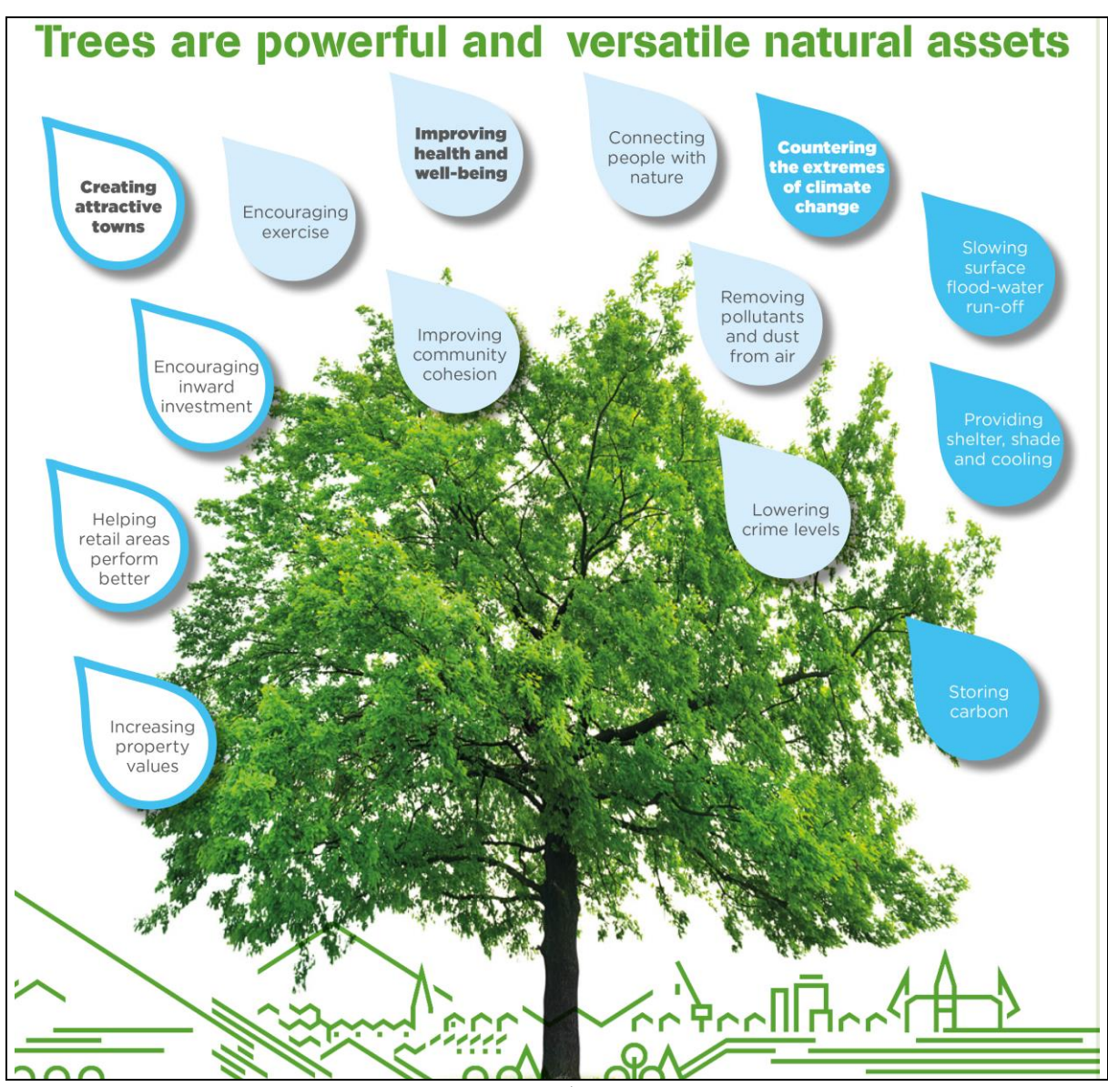
Figure 1. Trees are a powerful and versatile natural assets

A discussion paper<sup>8</sup> by the Woodland Trust cites various pieces of research into the effects that trees have on improving urban air quality. It is estimated that poor air quality reduces UK life expectancy by 7 to 8 months and costs an estimated £9-19 billion a year.