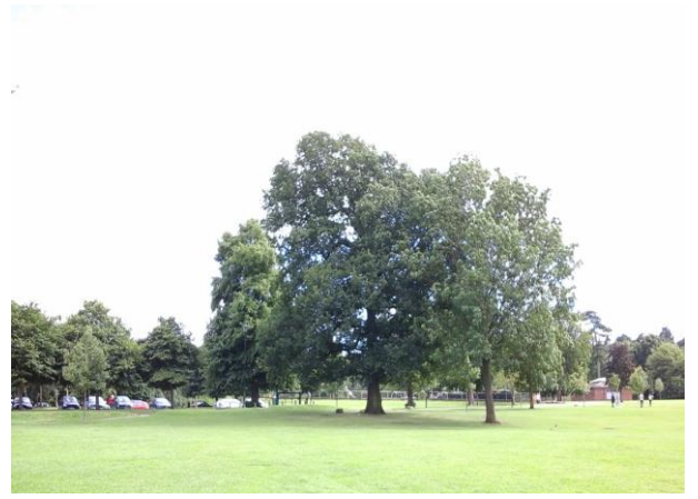
Plate 2. Mature trees and parkland at Wepre categorised as Formal Open Space

To increase biodiversity there is also the opportunity to sow wildflowers adjacent to trees where reduced grass cutting occurs as part of revised open space management.