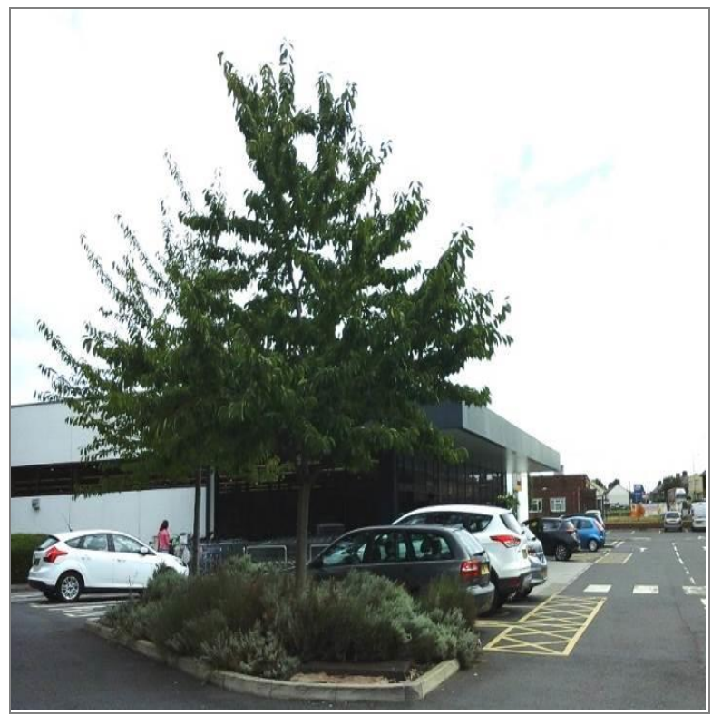
Plate 11. Landscaping in a new retail development, Flint

Policy L1 of the Flintshire Unitary Development Plan is the policy that supports landscaping and states that; New development must be designed to maintain or enhance the character and appearance of the landscape.