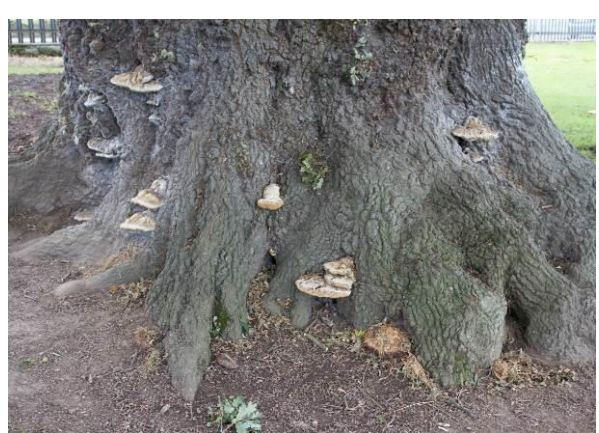
Plate 14. Base of ancient oak at Ysgol Bryn Gwalia