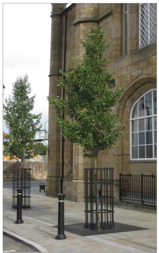
Plate 15. Treegeneration funded tree planting in Flint

The plan seeks to be a key document in securing funding from the Welsh Government under the Sustainable Development Fund and other Welsh Government grants that are expected to become available in the future. Occasionally grant funding for tree planting becomes available at short notice and the plan will be able to identify suitable sites that can be planted 'off the shelf' at short notice.