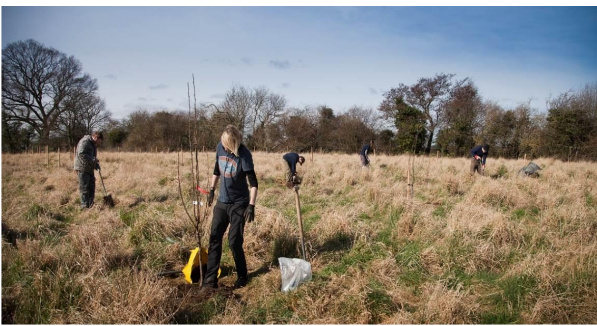
Plate 14. Volunteers planting orchard trees at Llwyni on the edge of Connah's Quay

Partners for the delivery of the plan will include town and community councils, with other partners potentially including Coed Cadw/Woodland Trust. The Countryside Service has already established good working partnerships and manages woodland at Caergwrle Castle on behalf of the community council.