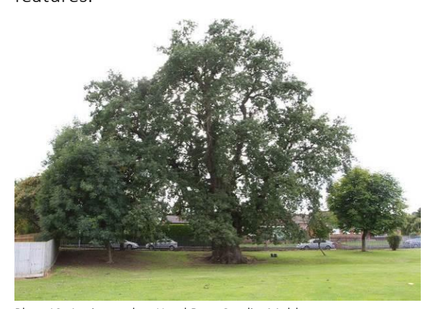
Plate 13. Ancient oak at Ysgol Bryn Gwalia, Mold

Ysgol Bryn Gwalia in Mold has an ancient pedunculate oak growing in the grounds with a trunk girth of 8.30m, the largest known in Flintshire. The oak is the school's emblem and the most accurate estimate of the tree's age using White<sup>53</sup> is 774 years. Despite the oak's great antiquity the tree is remarkably uniform and vigorous and because of this lacks veteran features.