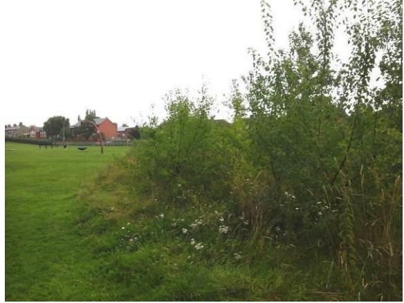
Plate 3. Whip tree planting undertaken at The Willows, Hope categorised as Formal Open Space

To assist with creating a diverse and resilient tree cover less common tree species will be used. These less common species will also provide added interest and will not look out of place in a more formal landscape. Within Formal Open Space there is an over reliance on mature and late mature trees to provide canopy cover and new planting will result in a more varied age structure.