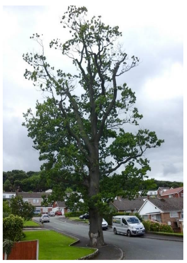
Plate 12. A mature oak in decline subject to frequent inspections

The risk of being killed or injured by a falling tree is frequently exaggerated. This is believed to be due to over reporting of incidents by the media, probably because they are considered to be a freak occurrence and newsworthy<sup>37</sup>. Statistically, the risk of being killed by a falling tree or branch situated in an area of high public use is extremely low<sup>38</sup>.