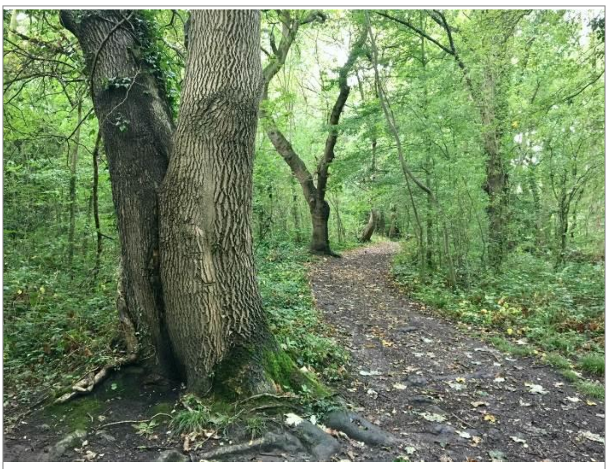
Plate 12. Urban woodland at Wepre Park

The council will protect and enhance its own urban woodlands guided by long term woodland management plans. Management plans will be based upon a policy of continuous cover so that long term canopy cover remains stable or is increased. Felling will only be carried out for overriding safety reasons, to facilitate natural regeneration or carry out new planting. Where felling is considered acceptable it will only be carried out in small woodland compartments or as a thinning operation. In exceptional cases young scrub woodland may be cleared to enhance particularly rare plant communities (e.g. limestone grassland), geological features (e.g. limestone pavement) or ancient monuments.