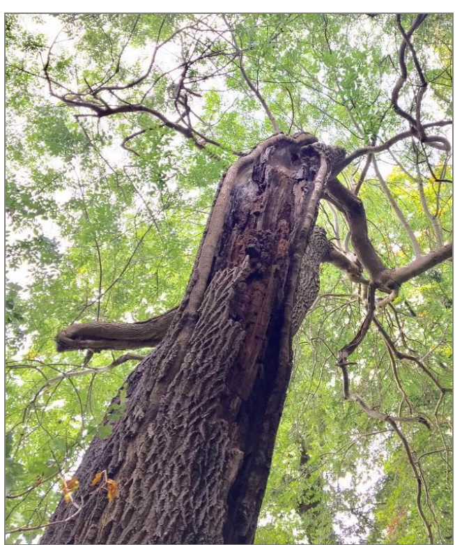
Plate 13 A decaying tree with bat roost potential

Many species of principal importance for the conservation of biological diversity are dependent on, or are associated with trees and woodland. These species include dormice, great crested newts, bats and badgers as well as many species of bird, invertebrate, lichen, moss and liverwort.