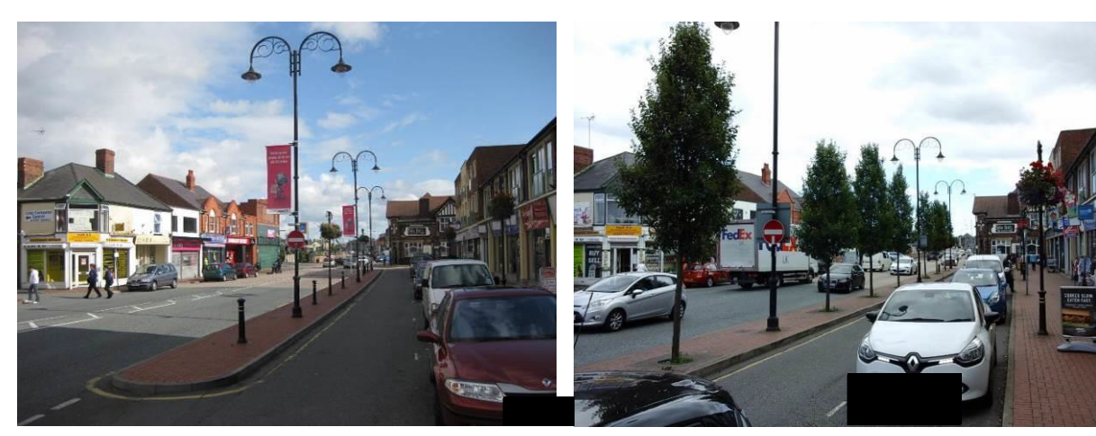
Plate 7 and 8. Flint street tree planting undertaken in 2013 (Before, left and after, right)

When planning and implementing tree planting in hard surfacing best practice guidance within Trees in Hard Landscapes will be followed and the guiding principles of Manual for Streets 2. For successful tree planting to be undertaken in streets it will be necessary to overcome technical issues and objections that have traditionally occurred.